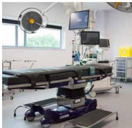
A brand new paediatric ophthalmology department