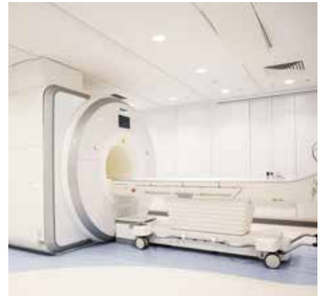
An MRI scanner