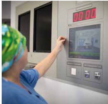
Six operating theatres including two computer integrated operating theatres