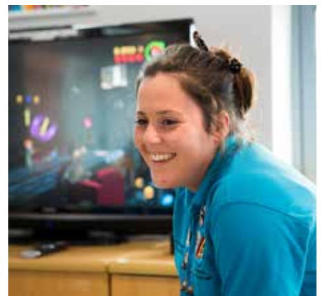
We also helped to build the teenage cancer unit and we fund the amazing play therapy team

Together we are working to save lives and create futures.