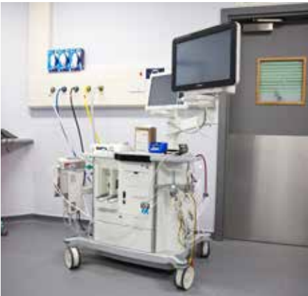
A brand new critical care unit supporting those needing high dependency and intensive care

Thanks to the bottomless generosity of our brilliant supporters, we have funded: