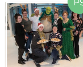
Shrek the Musical